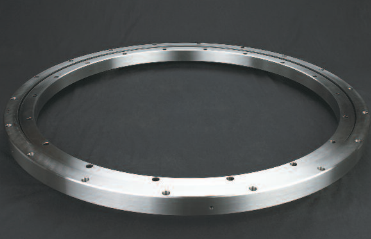
X Roller Bearing: Steel, beverage, or pulp & paper applications