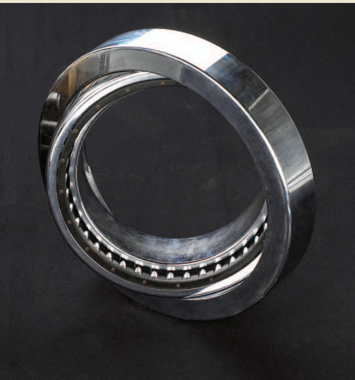
Reciprocating ball bearing for the paper industry