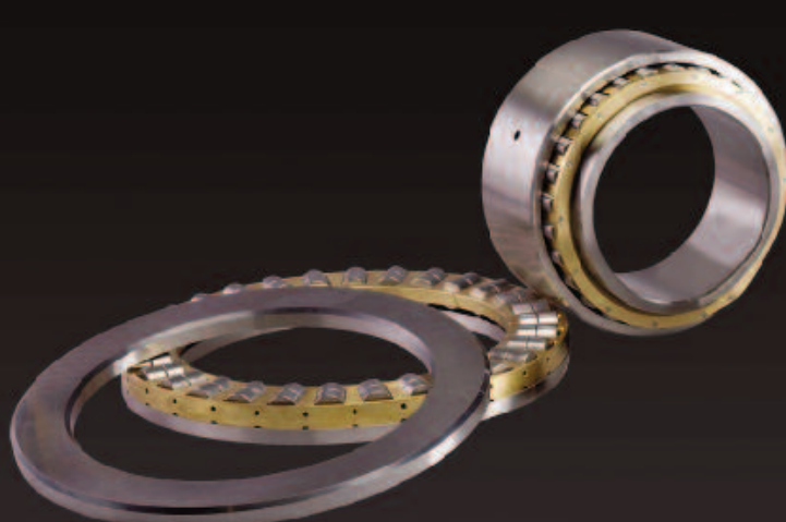
Thrust & Radial Roller Bearings for mining and quarry applications