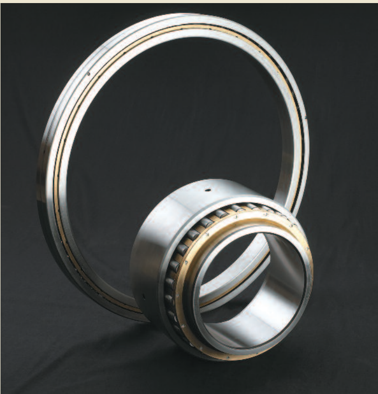
Self-aligning Radial Bearing – ideal for pulp & paper equipment